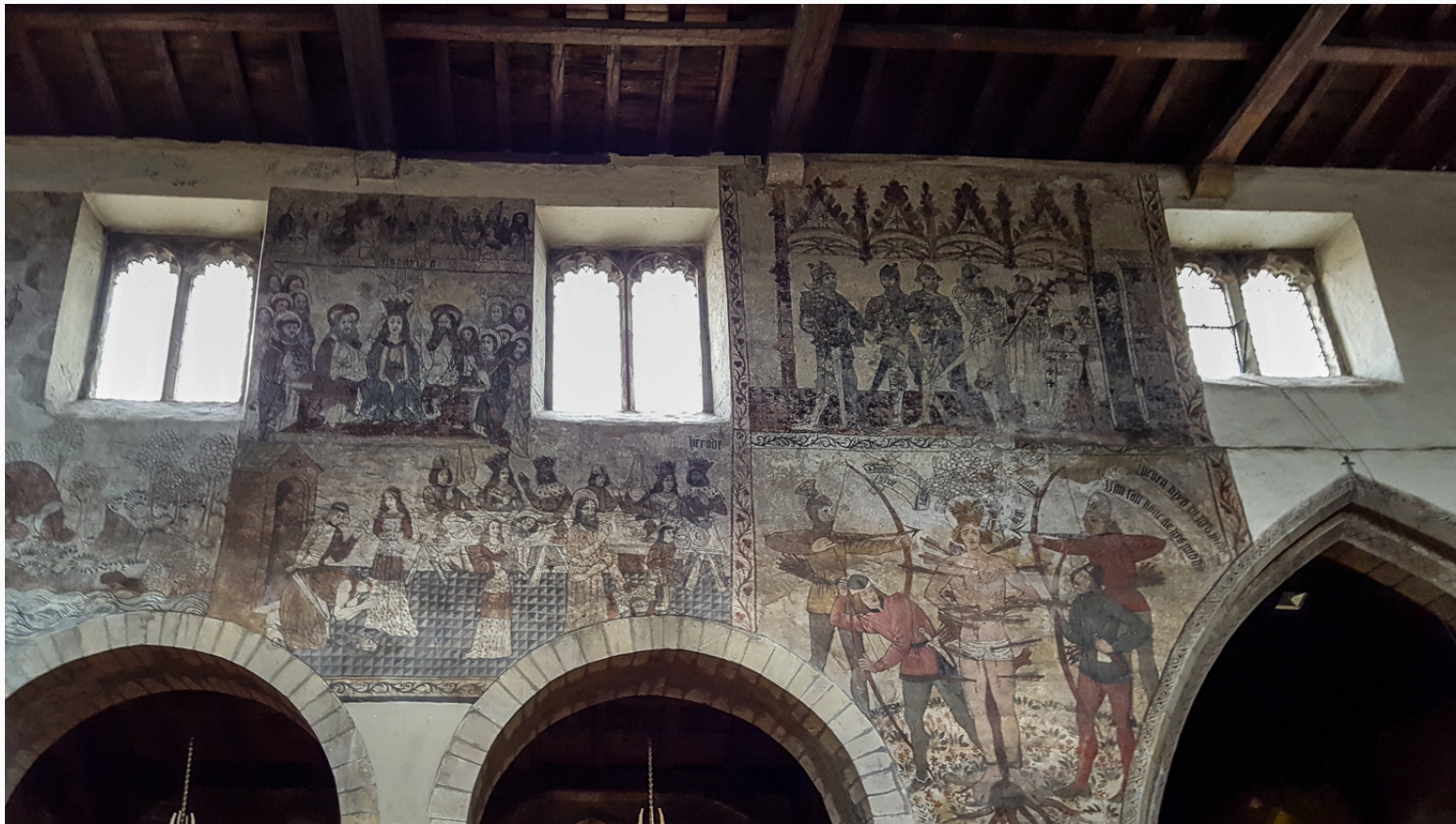
Wall paintings in St Peter and St Paul's Church, Pickering.