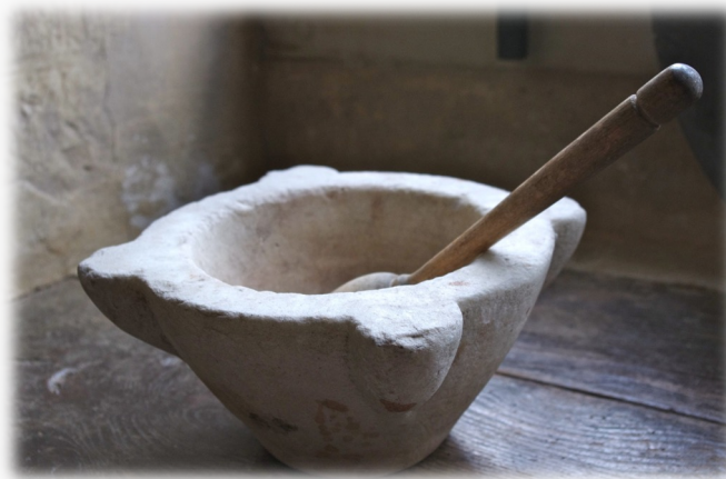
Middle: A pestle and mortar for grinding. Right: Cadmium orange pigment.