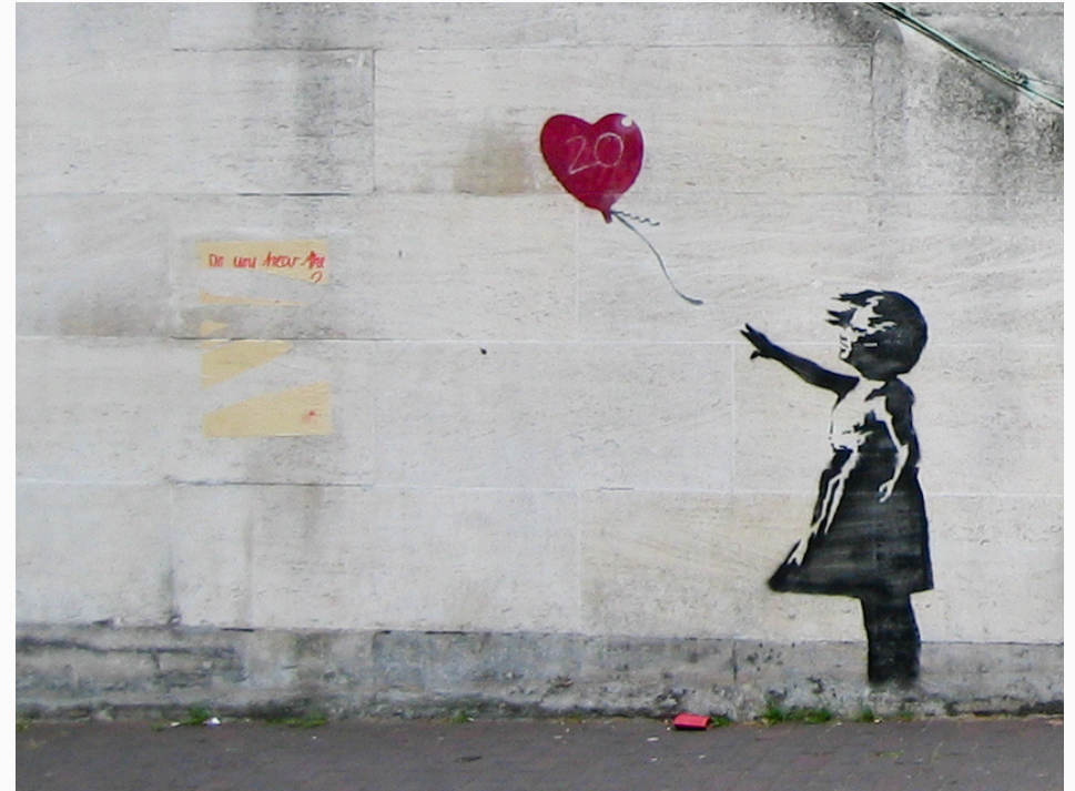
Banksy, Girl and Heart Balloon. Southbank, London . Creative Commons.