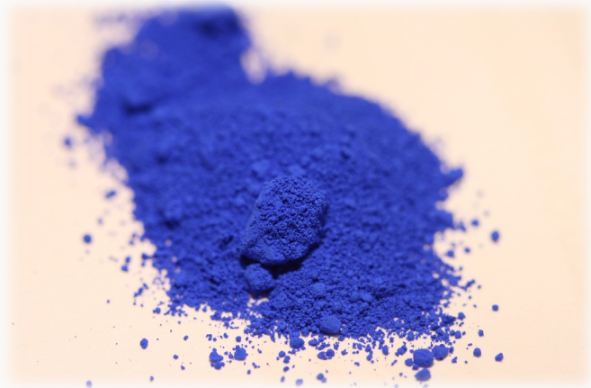
Left: Ultramarine blue pigment.