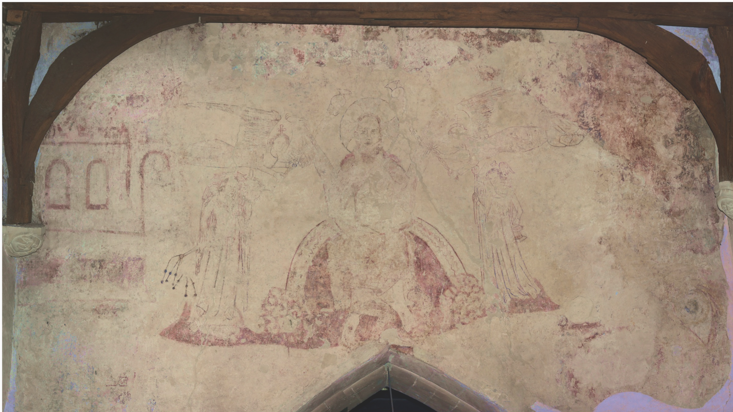
St Leonard's painting of the Day of Judgement.