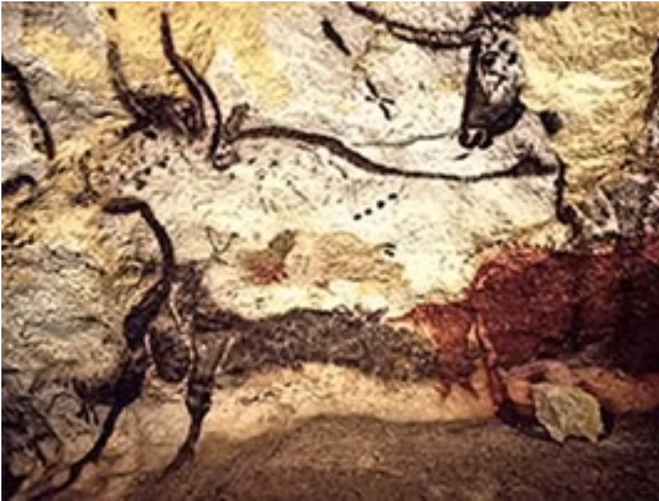
Above: A cave painting from Lascaux, France . Creative Commons.