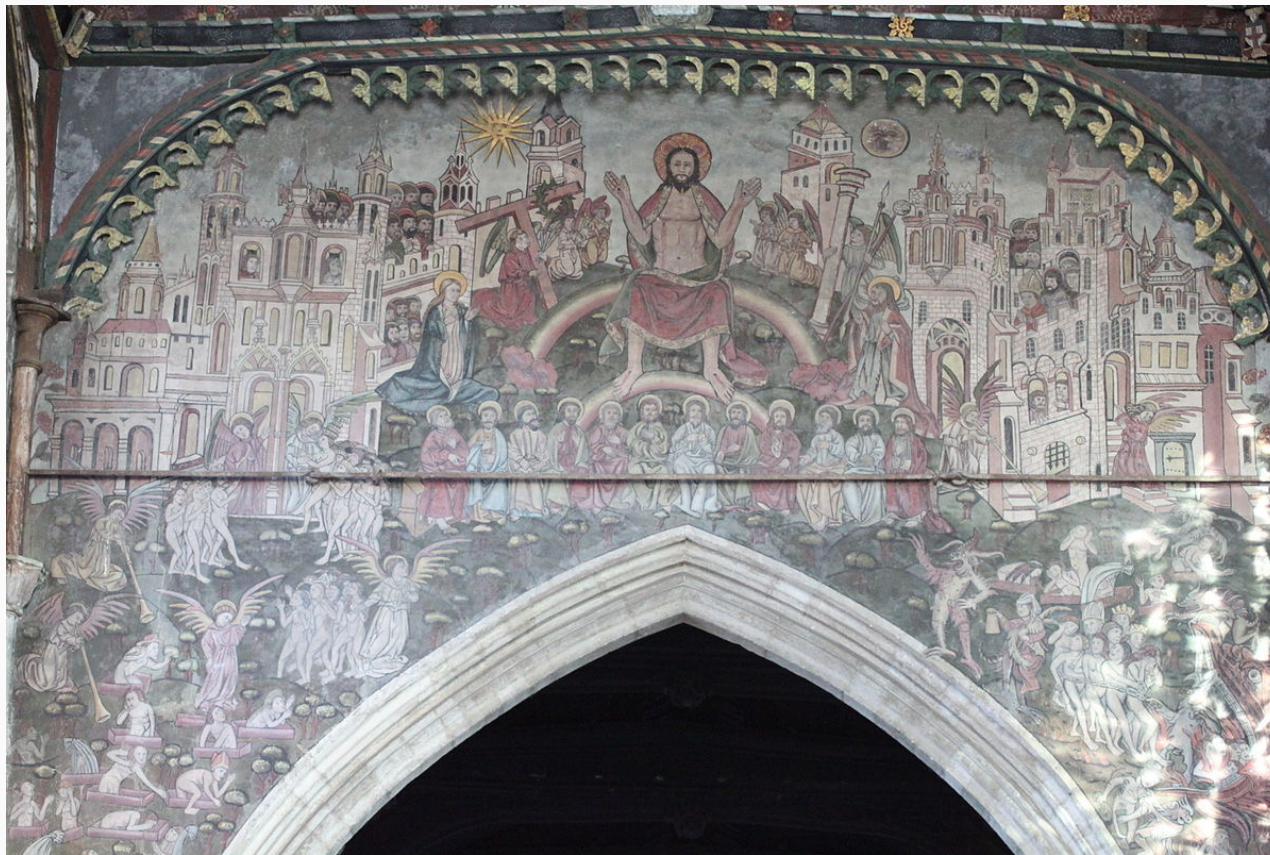
The Doom wall painting, St Thomas's Church, Salisbury..