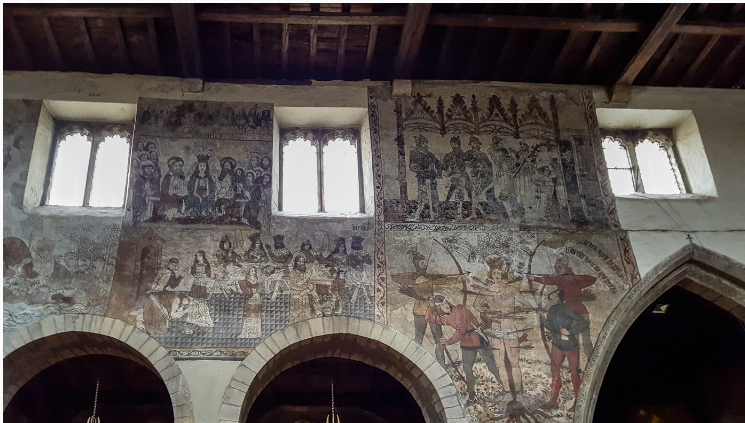
Wall paintings in St Peter and St Paul's Church, Pickering.