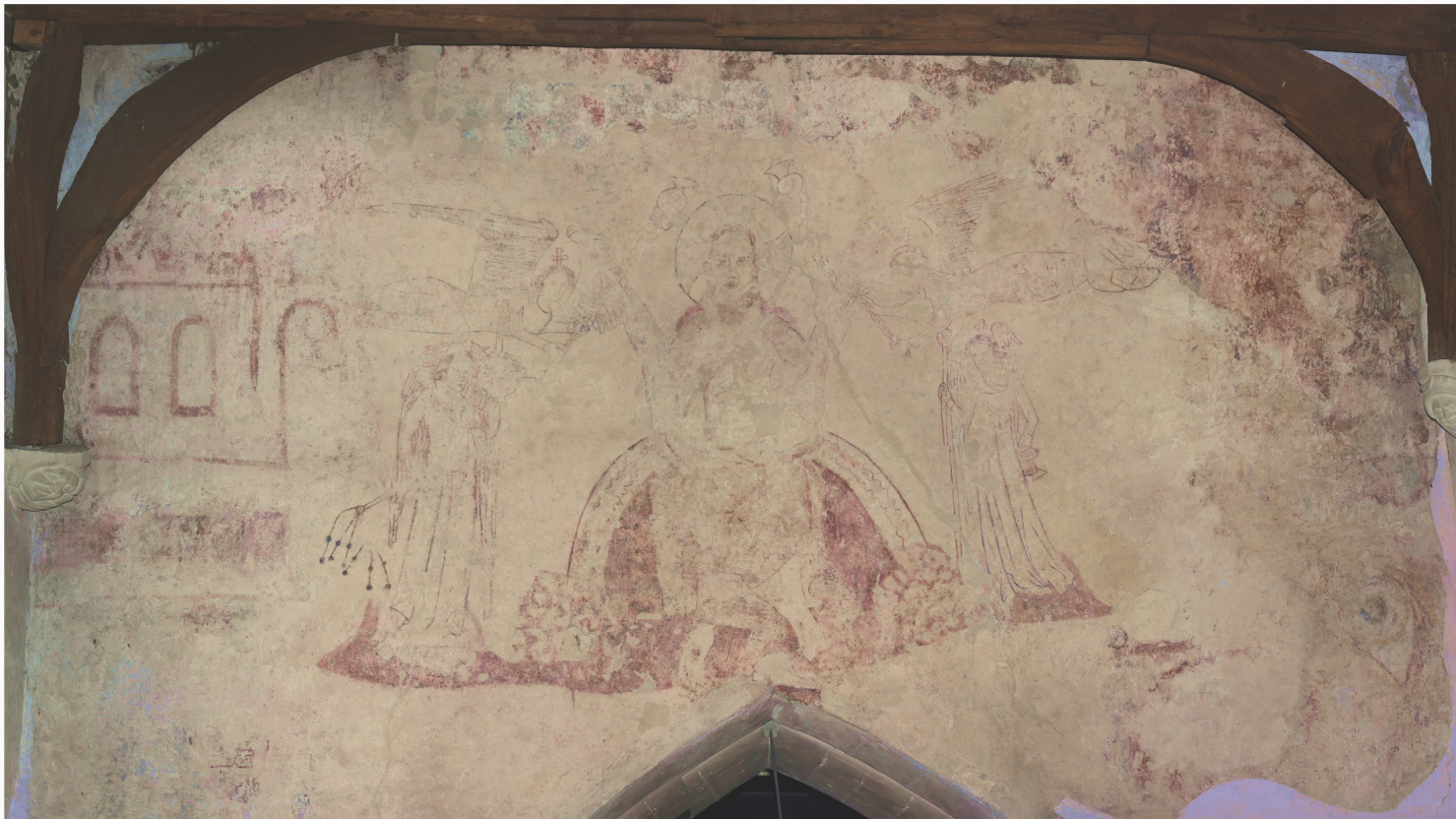
St Leonard's Doom Painting: the Day of Judgement.